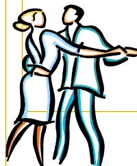
Dancing is great fun and fantastic exercise!

MADS Club: Murray After Dark Social Club is an out on the town evening with your Teachers and friends. It is held the first Wednesday of every month at 9:45 pm at a designated local dancing